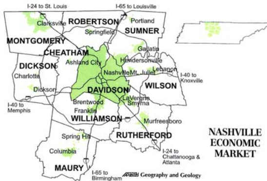
NASHVILLE ECONOMIC MARKET