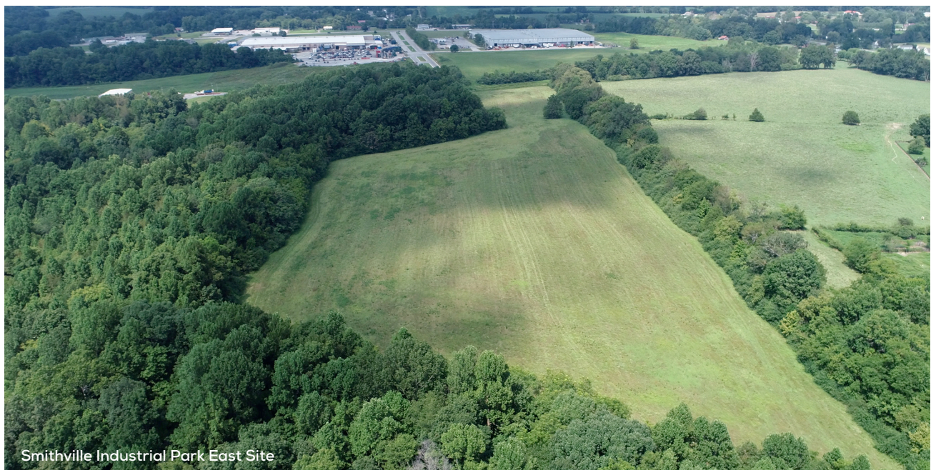
Smithville Industrial Park East Site