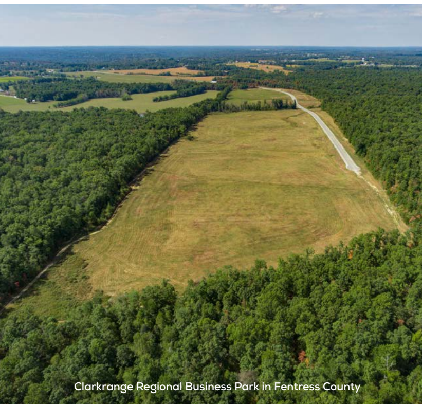
Clarkrange Regional Business Park in Fentress County