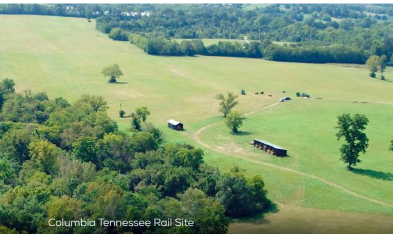
Columbia Tennessee Rail Site