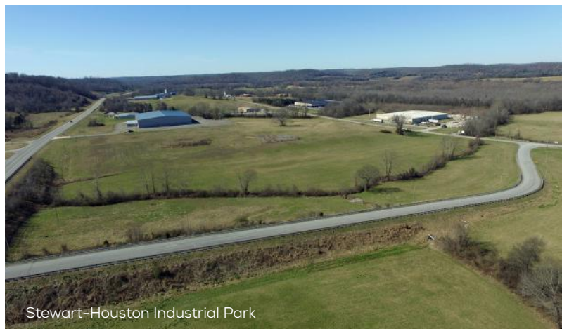
Stewart-Houston Industrial Park